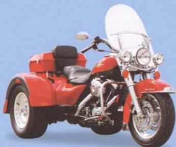
72 Lehman Trikes Renegade