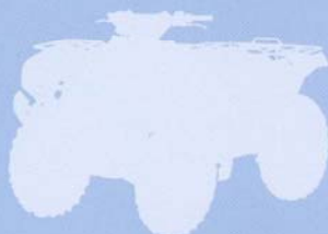
79 Kawasaki KVF 650