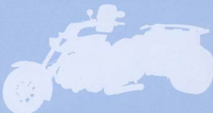
76 Cheetah Chopper SS