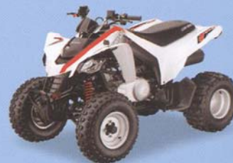
74 Can-am DS 250