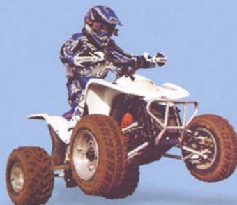
73 Apache F100