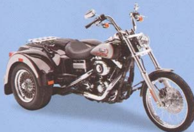
78 Lehman Trikes Dyna