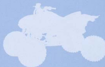
77 Honda TRX450 R