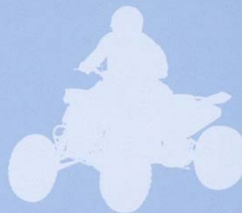
71 Can-am DS 450

Not all bikes have two wheels – trikes have three and quads have four. Some people like to ride them because their extra wheels make them easier to ride. But most people like to ride quad bikes and trikes because they are such fun!