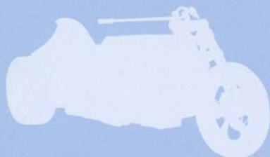
75 CC Trikes 'Tri-Zilla'