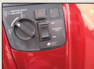
Adjustable Lean Control