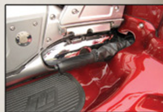
Standard parking brake