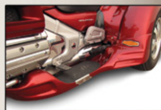
Wing EFX Running Boards