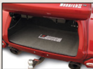
6 cu. ft. trunk space with vertical lift door